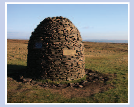
The Scout Cairn on Pendle Hill.